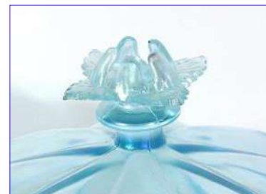
This one is the flower top

Both finials were molded as part of the cover but the flower top required the finisher to re-shape the petals to create the flower.