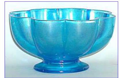
The ‘normal’ bowl looks like this.

We are going to look at Fenton’s mold #847 which is referred to as “Melon Rib” and was used to make a bowl approximately 6” wide, 3 1/2” deep with a base that is 3 1/4” in diameter.