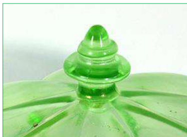
This one is the nipple top

There were a couple different finials used on the lids.