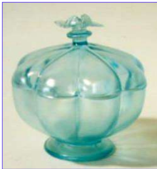
When a cover is added, we have a candy box.