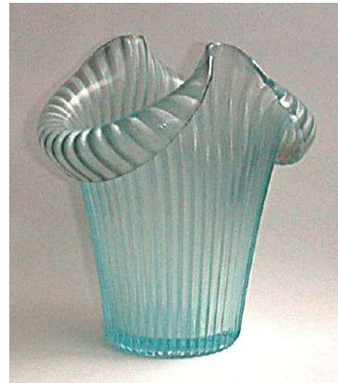
Fenton 'Sheffield' Vase