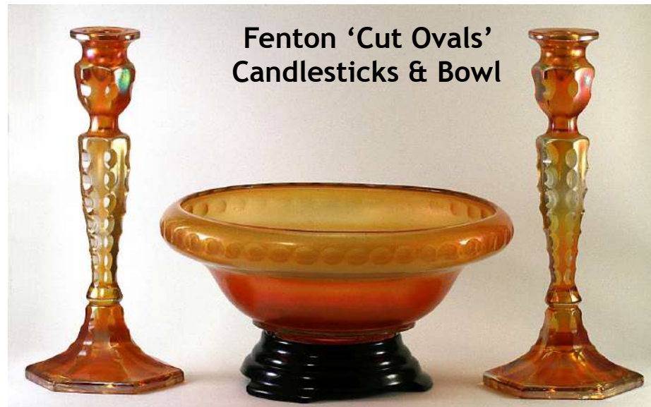
Fenton 'Cut Ovals' Candlesticks & Bowl