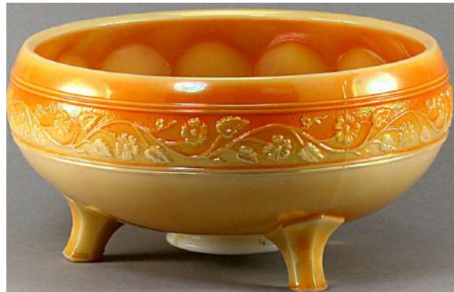
Imperial 'Floral & Optic'