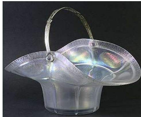
Fenton 'Plymouth' Basket