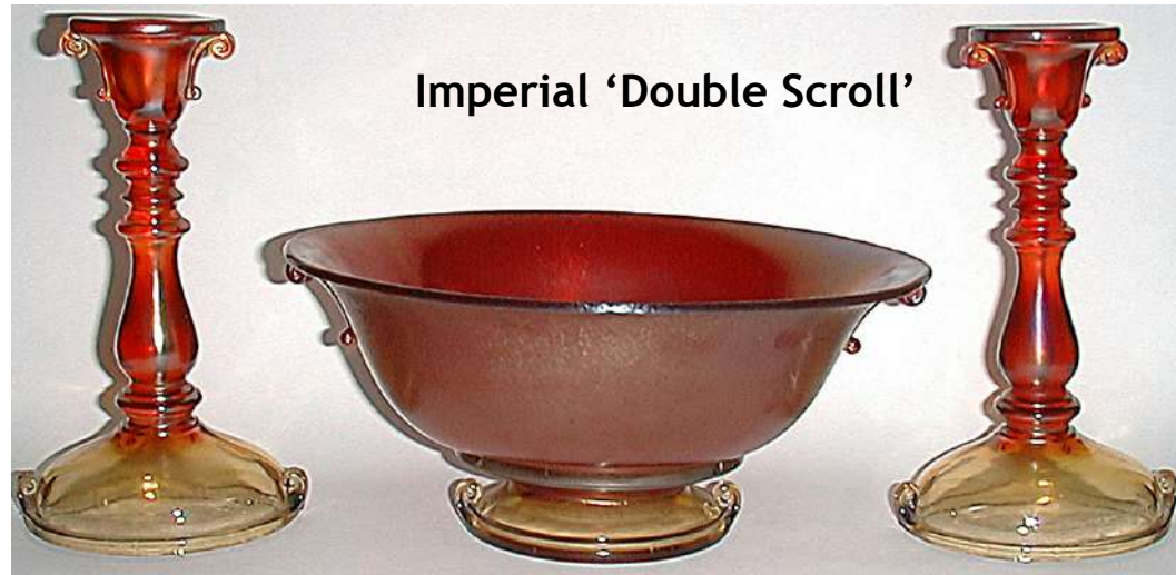
Imperial 'Double Scroll'